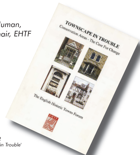
EHTF's 1992 'Townscape in Trouble' publication