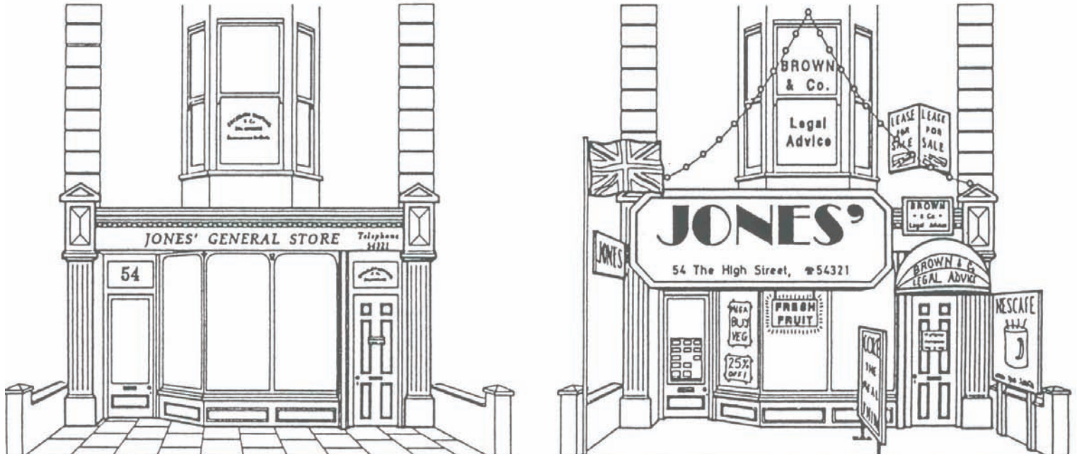
A typical unlisted shopfront in a Conservation Area (left), and (right) badly affected by a collection of signs and advertisements which can be installed with the benefit of 'Deemed Consent'. i.e. without permission