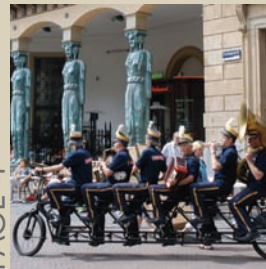
Netherlands Study Tour