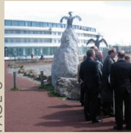
Morecambe Conference report