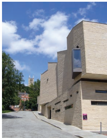
Lincoln's Cathedral and Museum

Effective characterisation is essential at both local and regional levels to ensure that the townscapes we create are valued both today and tomorrow.