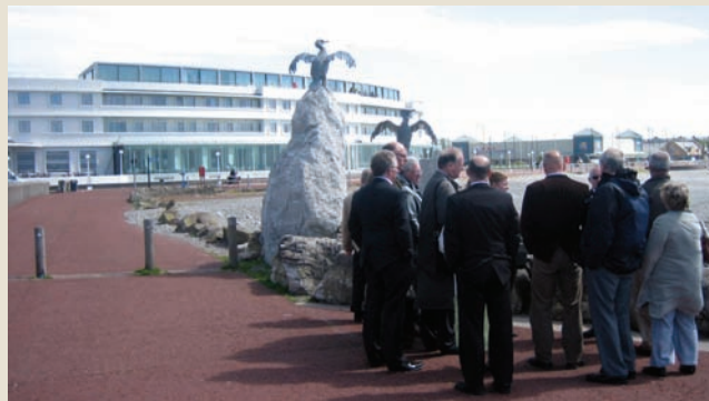
Delegates on a tour of Morecambe (Tern Project sculpture and the newly refurbished Midland Hotel in the background).

He thanked everyone who had contributed to the conference, especially NWDA for their support and Lancaster City Council for their invitation.