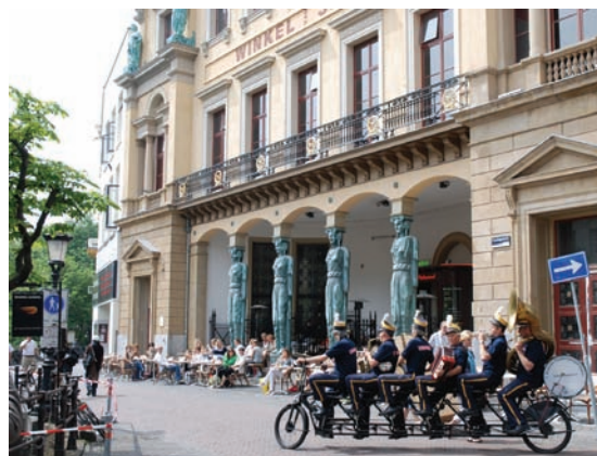
Bicycle Band: Enjoying the public realm