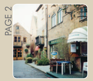
'The Great Town' Academy of Urbanism Award Winner