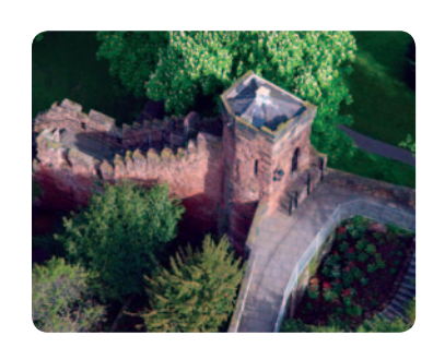
Bonewaldesthorne's Tower Chester

For further details of both events and online booking facilities please see www.ehtf.org.uk.