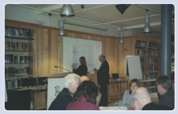
Members come together for the EHTF Strategy Meeting

survey responses, will be used by the Executive Committee, at mulate the strategies and work programmes for the coming able to respond to the issues of greatest importance to historic current local and national government agendas.