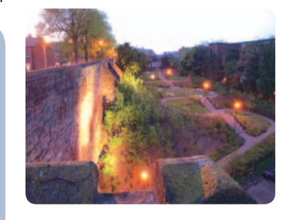
Floodlit City Walls, Chester