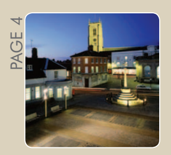
'Public Realm Focus'

If you would prefer to receive EHTF 'News' in a pdf format please email ehtf@uwe.ac.uk, giving your name, organisation and email address.