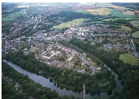
The Peninsula: Area Specific

Delivery across a diverse Cityscape is complex but aims to change Durham from a ‘2 hour destination to a 2 day destination’ by presenting all the assets together.