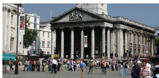
Places where people walk, drive, cycle, are pushed or carried

The Why? and How? are explored in some depth in the new document, with input from experts and practitioners on the role of streets, strategic and partnership working, the economic benefits of investment, the question of 'risk' and examples of good practice on a wide range of topics including: signage, parking, local distinctiveness, lighting, public art and surfaces. Extensively illustrated, the document ends with twenty two principles which the Forum proposes to underpin good practice. Ian emphasised the need for coordination and the Forum's belief that a single 'champion' for the streets should be appointed to take an overview of the 'place'. Ian thanked English Heritage and CABI and all contributors for their support for this document and said that although this and other publications were taking the agenda forward there was still a long way to go, and EHTF would continue to work with partners to continue the progress.