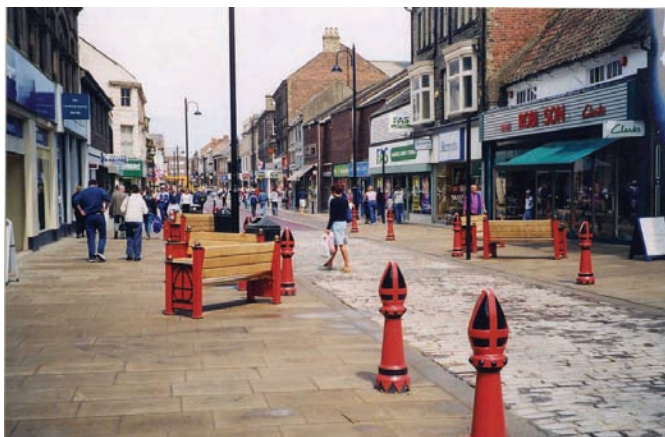
Newgate Street, Bishop Auckland after enhancement