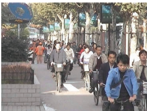
"There are lessons to be learned in ..... a different (more sedate) approach to cycling"

He said that historic towns had always lead the way in transport innovation; members of the Forum had pioneered pedestrianisation, park and ride, high frequency mini buses, road charging, cycle bridges and a guided bus-way. There were also lessons to be learned, in particular with regard to a different (more sedate) approach to cycling, from China and Holland, with more cycle lanes and the use of electric bikes. He asked "What more can we do with the bus?" which had hardly changed over decades. He explored the potential of PRT systems, the expansion of which might depend on outcomes of the model to be trialed by BAA at T5 later this year.