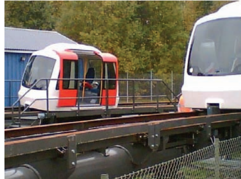
Personal Rapid Transit systems are being trialed by BAA later this year