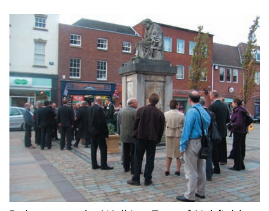
Delegtes on the Walking Tour of Lichfield

Walking tours, followed by discussion groups, helped delegates to explore the issues in detail.