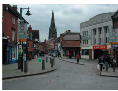
Lichfield - new design in historic context

a conservation area encompassing the whole centre. It demonstrates all of these issues under examination: successful use of Article 4 Directions, Conservation Area Appraisals and Management Plans, new uses for old buildings, new buildings in a historic context, a new retail development and public realm improvements.