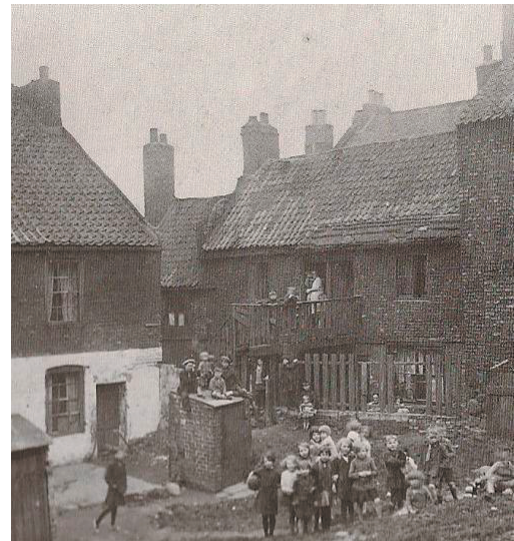
Ouseburn Valley, Newcastle in the late nineteenth century

of this in Newcastle: the Stephenson Quarter, the Lower Ouseburn Valley and the Quayside. Today, he concluded, the City is a mix of modern development and industrial and engineering heritage, which is epitomised by the Tyne bridges – a modern day version of "building a new Jerusalem amongst the dark satanic mills!"