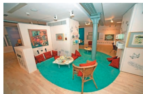
Seven Stories national centre for children's books

Finding the right location brought together an area with an important industrial past and landscape heritage – the Ouseburn Valley, a thriving artistic community and a regeneration area. Kate described the industrial past of the Grade II listed former storehouse, which was in a serious state of disrepair, but which was purchased in 2002 for the project. Through wide consultation and working with schools, teachers, authors and illustrators the vision grew. A long and complex design and building process followed, with contributions from a range of funding sources. Since the opening in August 2005, the centre has welcomed 150,000 visitors; it has five galleries, a book shop, café, performance space and creative discovery centre.