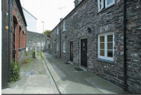
Industrial workers' housing

in 2004 with CADW and local authorities, which attempts to extend the conservation approach to less recognisably historic areas. The reinstatement of architectural detail, such as Welsh slate roofs, sash windows and chimney stacks, can make a positive contribution to the area as a whole. Judith gave several examples of schemes in Wales, each with specific qualities but all contributing to the social, economic and cultural history of the country. Characterisation has emerged as a useful tool for recording local features, which in turn relate to local history, and the result of these studies is an account of the complexity and richness of the urban industrial landscapes.