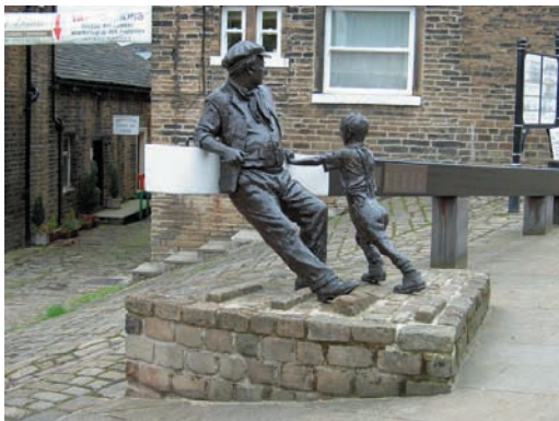
"There are social resources as well as other assets embedded in historic buildings"