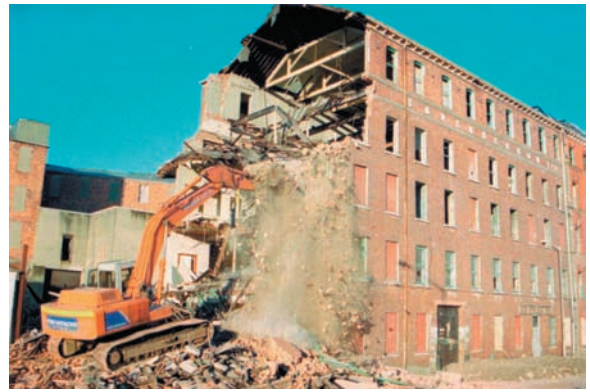
"'frenzied' development and a 'knock it down and move on' attitude"

The 'short break' amounted to a kind of voyeurism, Paul thought, and evidence of the real history had already gone, although investment in places like the Titanic Quarter, the City of Derry and the Cathedral Quarter were showing economic returns. He showed examples of the evidence of the more recent past – the watch towers and wall paintings – reminders which drive the current priorities for the North, to achieve peace and stability, demilitarisation, economic catch up, neighbourhood regeneration and private sector investment. The industrial heritage resource, he said, must find its place in this renewal agenda. Good things are happening and awareness is improving, although he thought it was vital that local authorities should have the relevant powers to protect the historic built environment, listing should still be controlled centrally. Overall he shared the Irish optimism.