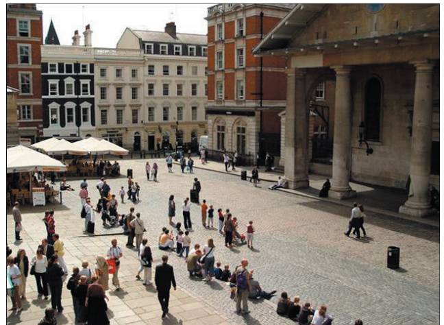
“streets - not roads - are essential for genuine - not contrived - activities”

The concepts of value were both direct and indirect and could be difficult to measure, but new ways were being found to do this and the 'Heritage Counts' suite makes a contribution to this. Case studies are also important, he said, to encourage others with challenging projects. He explored the benefits of clusters and webs of small businesses where 'creative quarters' had been established, which might also offer a sustainable model for living and working in the same place. Flexibility is the key, he said, and through conferences and publications to spread good practice and boost confidence, problems can be overcome. Recognition of the uniqueness and cultural identity of a place, together with its character, must be balanced with the needs of modern society, but Rob concluded that valuable heritage assets have an important part to play as catalysts for regeneration.