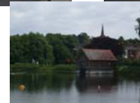
the Boathouse, Stowe Pool