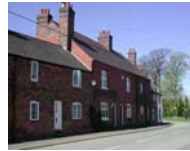
Main Rd, Wigginton