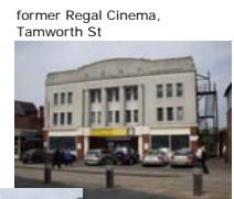
former Regal Cinema, Tamworth St