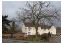
War Memorial, Main St, Alrewas