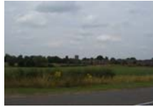
view into Alrewas CA