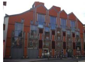
Garrick Theatre, Lichfield