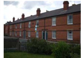
Moseley Terrace, Frog Lane, Lichfield