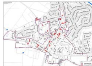
1 Main St, Whittington