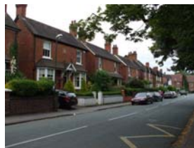
St Chad's Rd, Lichfield