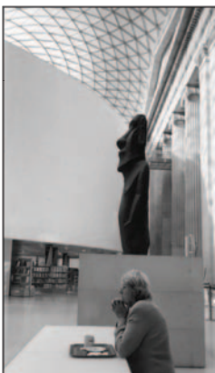
DCMS now publishes monthly figures on visiting museums

The DCMS has started publishing monthly statistics of visits to museums and galleries on its website. The Department wants operators, tourism managers and planners to use the figures to assess trends and build on successes. The details are at www.culture.gov.uk .